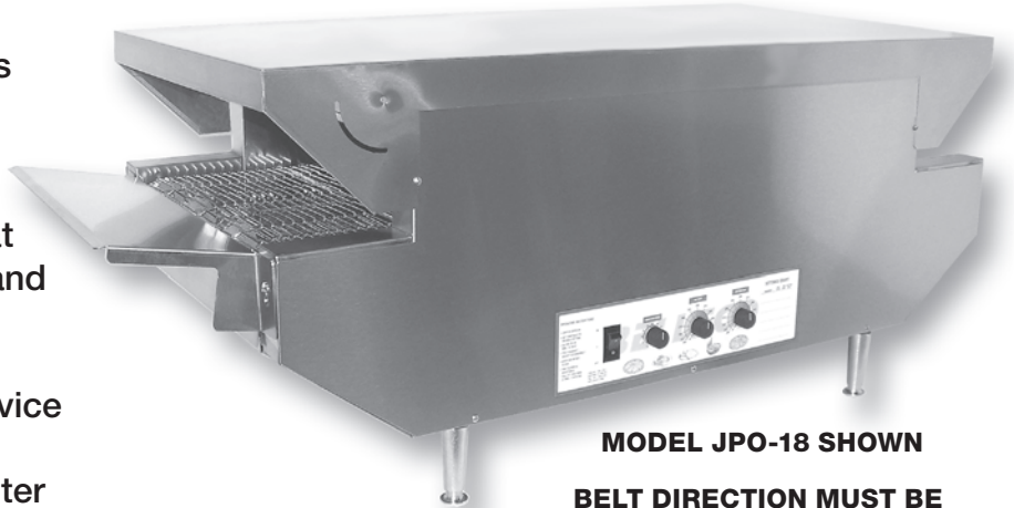
MODEL JPO-18 SHOWN

BELT DIRECTION MUST BE SPECIFIED AT TIME OF ORDERING