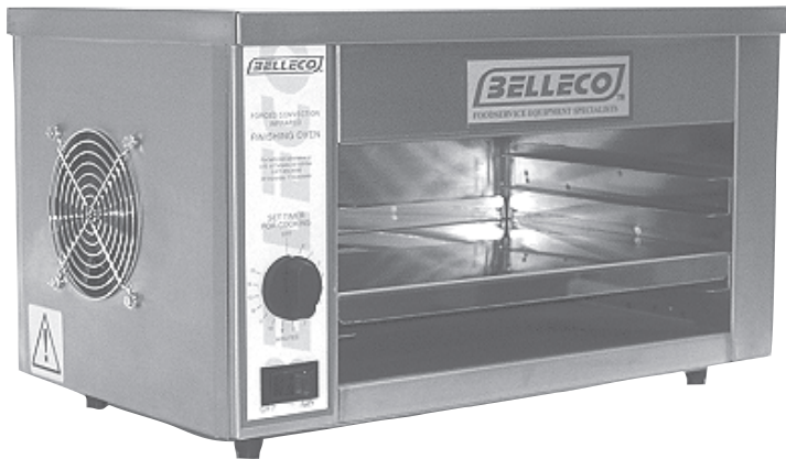
MODEL JW1 OVEN SHOWN